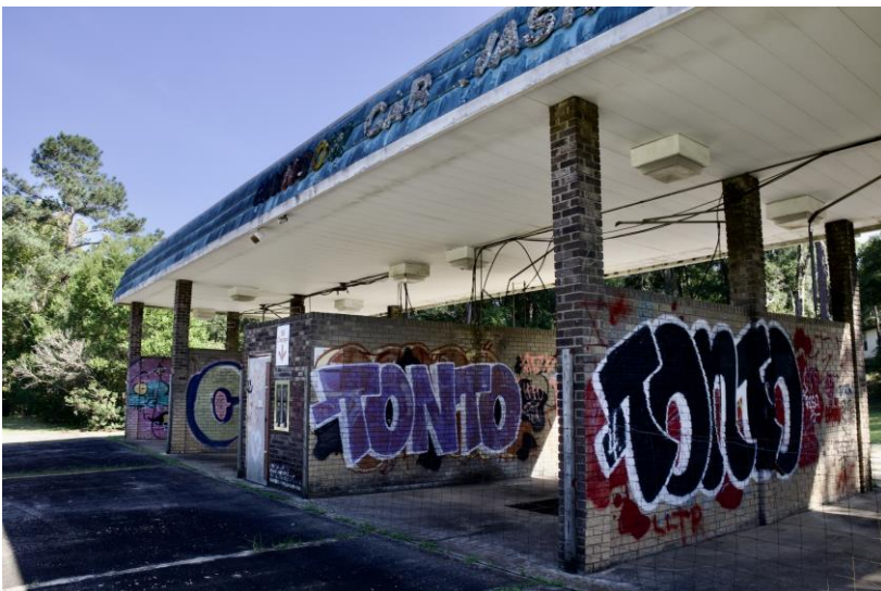
Clara Cook – Intermediate – 3 rd Place