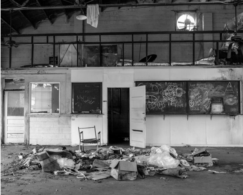
Pam – Intermediate 1 st Place