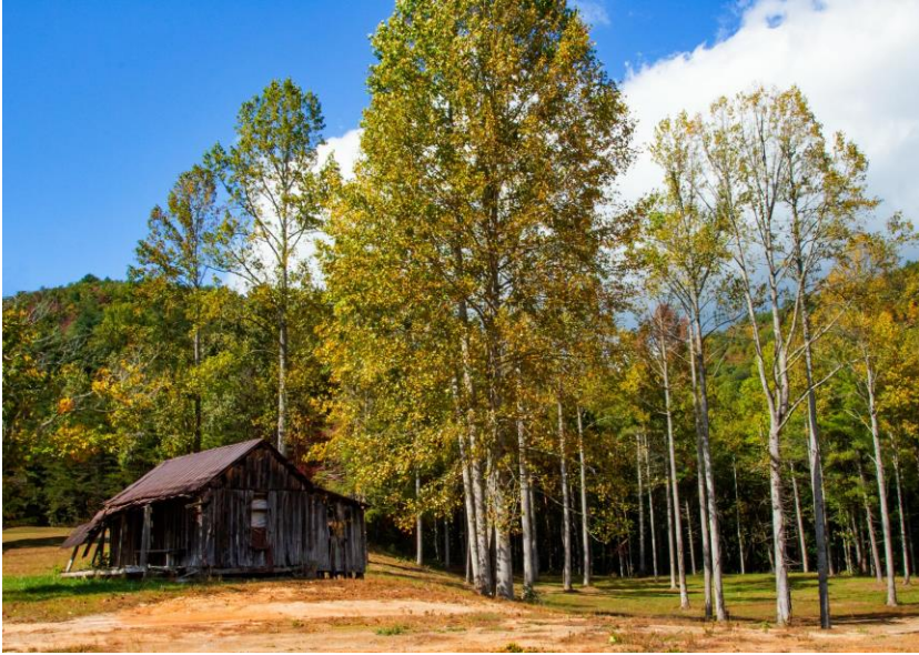
Dee Sartor - Intermediate 2 nd Place