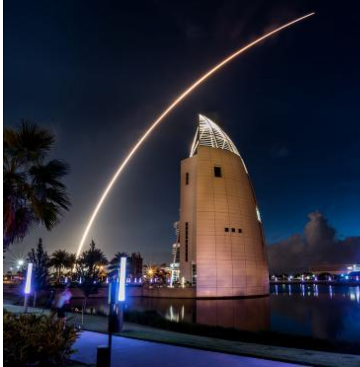
ULA Atlas V – Port Canaveral 18mm, 77sec, f/20, ISO 100

Lens Image Stabilization – Turn this feature off while photographing from a tripod