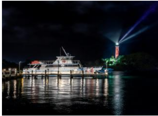
Jupiter Inlet Lighthouse – 35mm, 0.6 sec, f/8.0, ISO 640 – Three Exposure HDR

Many effects of nighttime long exposure photography can be stunning, resulting in “remarkable” portfolio-quality photos. Whether you are shooting a moving Ferris Wheel at the local Fair, light trails of city traffic or rocket ships, or a lighted city skyline, here are a few tips to consider when setting up your long exposure nighttime shot.