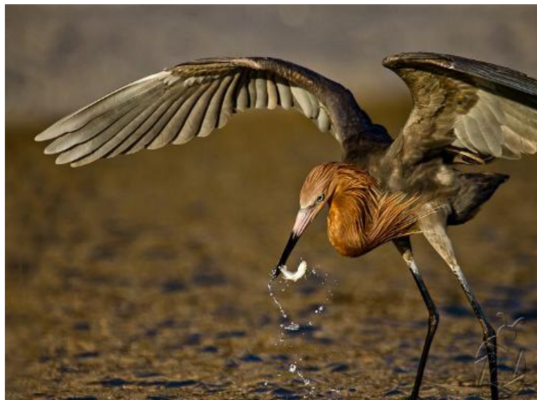
Flamingo Garden's Native Bird Art Exhibit 1st place Patty Corapi